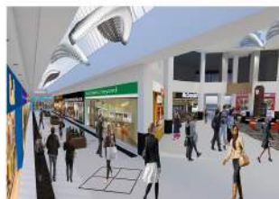
NEW INTERIORS FOR GOLDFIELDS SHOPPING CENTRE ARE UNDERWAY WITH NEW TOILETS AND PARENT FACILITIES